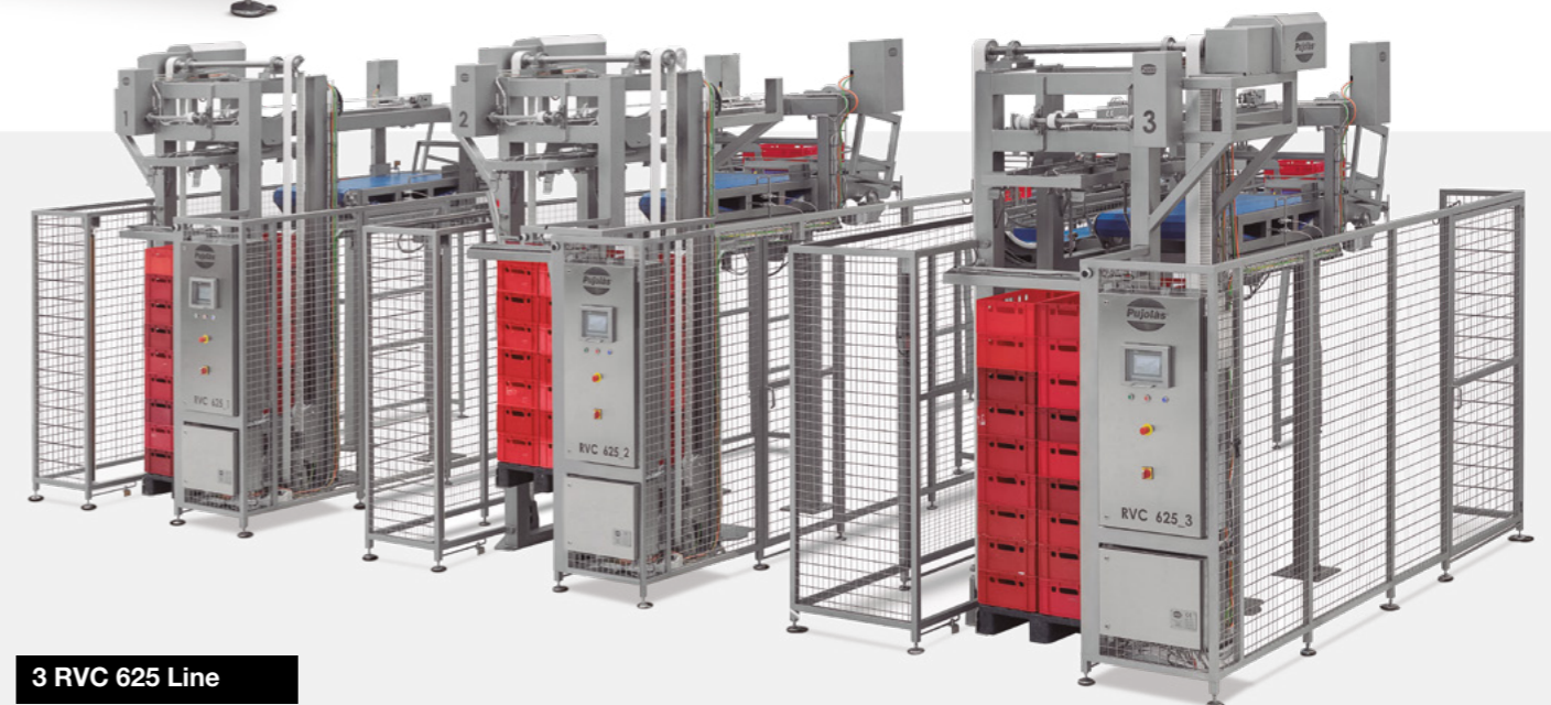
3 RVC 625 Line